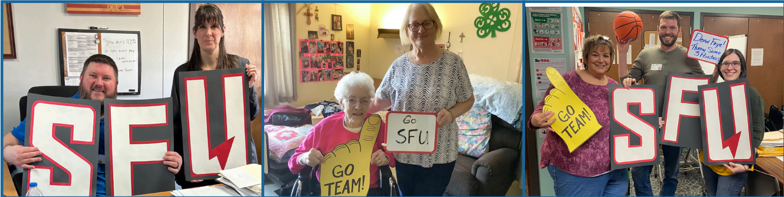
Crafts in Crossroads!