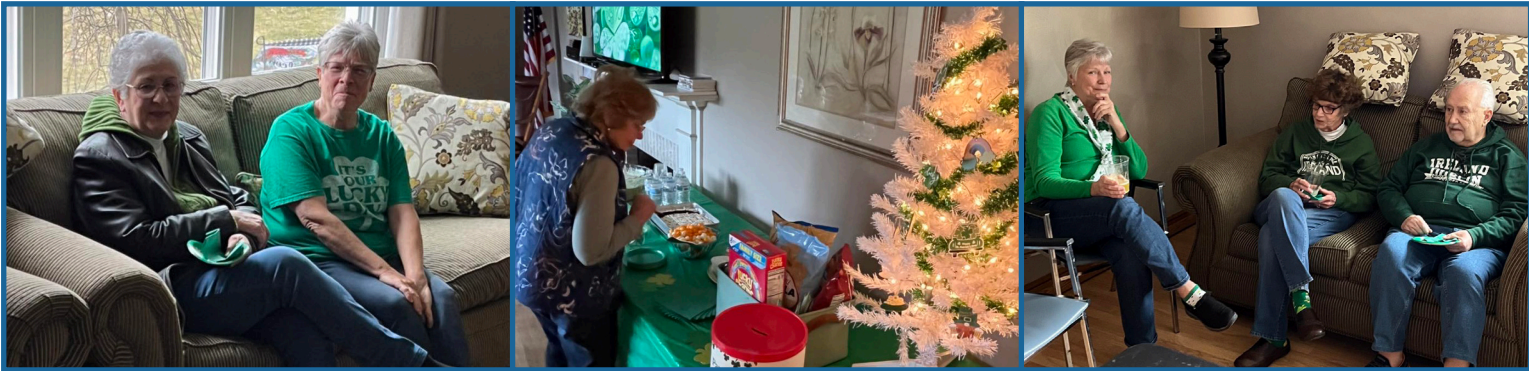
Cheering for Saint Francis Mens Basketball!

Follow us on Facebook for more photos! Facebook.com/ArbutusParkRetirementCommunity